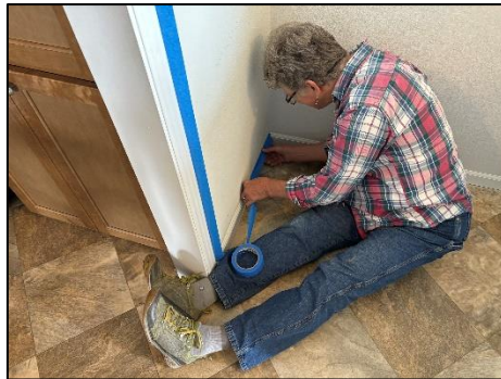
Several volunteers made their way to Camp Buckhorn on August 9 th to get it looking beautiful.